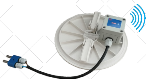
Installation of the R23KDE2 sensor on the skimmer cover of the pool.

Electronic panels and equipment for pool level control. This solution allows you to forget the status of the level of water, because the equipment maintains the optimum level for the correct functioning. Equipped with 230V/24Vac transformer for 24Vac filling solenoid valve. This regulation system does not requires wiring between the sensor and the receiver box because it works via radio. The sensor can be mount in any pool, skimmer, etc.